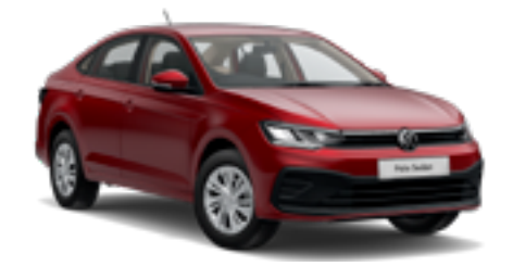
Wild Cherry Red Metallic