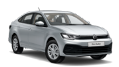
Reflex Silver Metallic